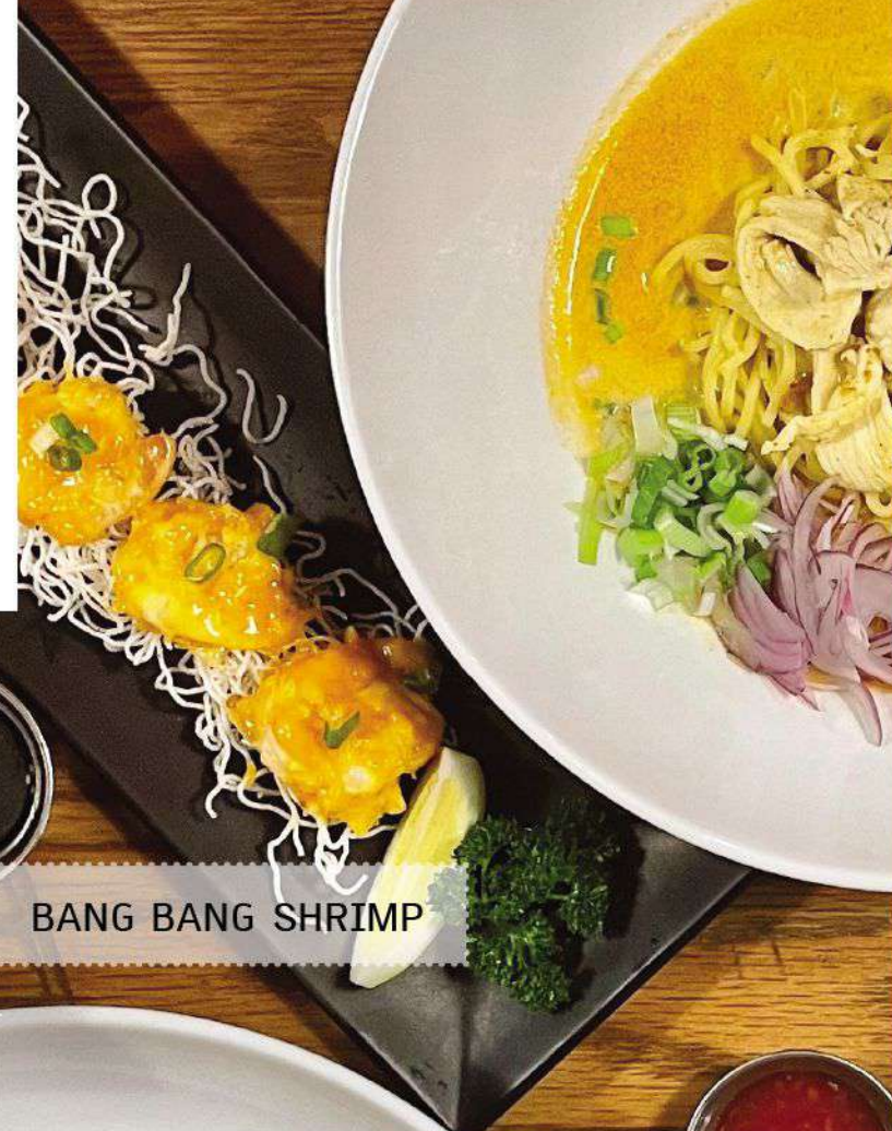
BANG BANG SHRIMP